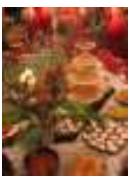
BSEC's Holiday Festivity December 13th 7:30pm-11pm

Unique crafts and gifts, children's area, and food. If you are interested in being a vendor, please go to www.bsec.org and complete an application. Hope to see you there!