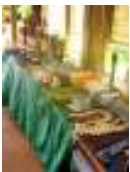
Annual Winter Crafts Fair December 13th 11am-5pm

Sponsored by: Center for Inquiry & Brooklyn Society for Ethical Culture